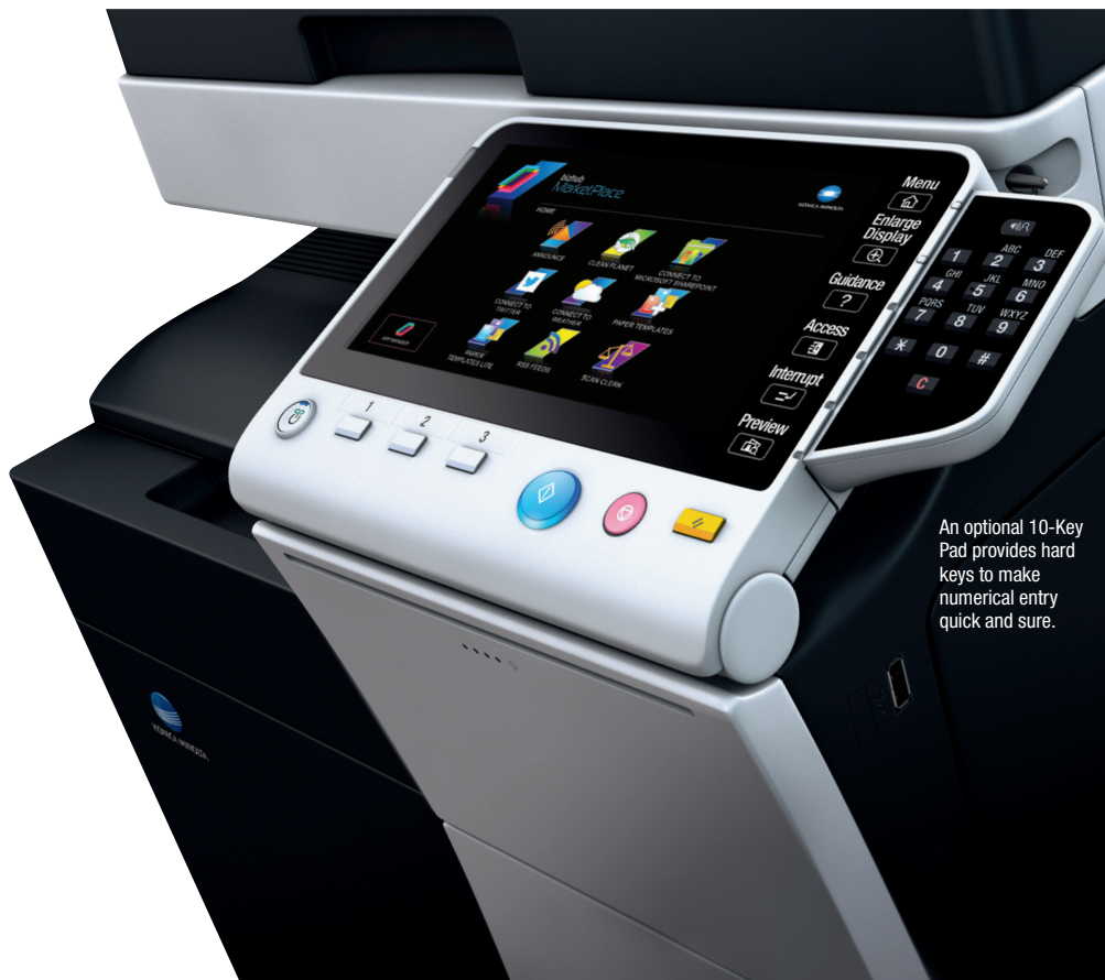
An optional 10-Key Pad provides hard keys to make numerical entry quick and sure.

In today's fast-moving digital world, needs keep changing – and Konica Minolta's EnvisionIT approach extends your power to take advantage of emerging business and professional opportunities. You'll have all the options you need: downloadable productivity apps, high-speed fax, i-Option kits and PageScope software to manage documents and devices. You'll also benefit from bEST integration with 3rd-party business software for specialized solutions – including variable-data printing, account tracking, cost recovery and more.